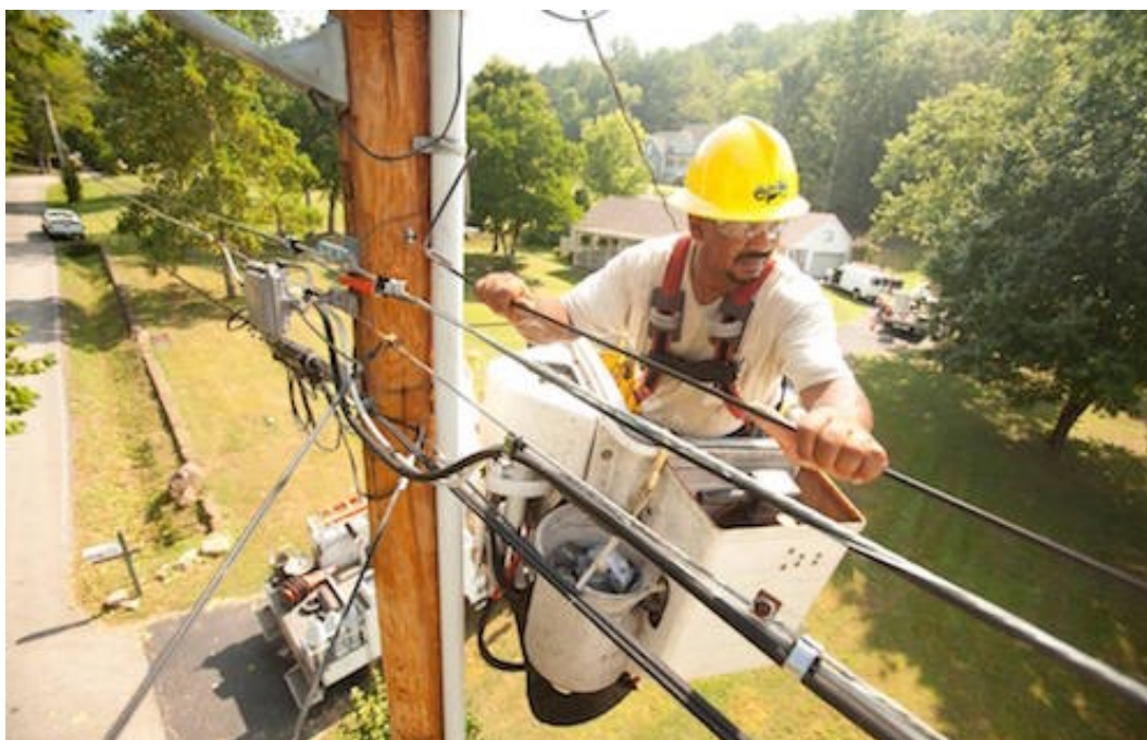
Chattanooga EPB Lineman

1 Chattanooga's EPB Fiber Optics is doing extreeeeeeeeemly well. Though the authors paint a bleak picture for it, the utility has just announced that it has paid off all the debt on the communications equipment. 11 The debt for the electric side has such a low interest rate, they see no reason to retire it early at this point. The utility has more than 90,000 subscribers and projecting net income of $26.6 million in FY 2017. It has no problem paying all of its costs and has a very secure future, but the flows may still not be balanced because the one time cost of connecting all those subscribers was significant. 12 Chattanooga's Electric Power Board has reported that its electric rates would be 7 percent higher if it did not have the fiber network and communications services.