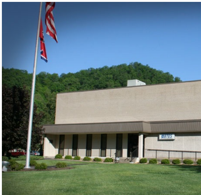
BTES Headquarters

The authors seem puzzled that the media has not caught on to the supposed story that Wilson's Greenlight Fiber network is exhibiting financial distress. 13 The media isn't confused, the authors are. When evaluated correctly, Wilson's Greenlight is financially strong. The network invested significantly in early years to connect subscribers and is in no danger of being unable to pay its operating costs or debts. Wilson's top 10 employers all use the municipal fiber network and more than 700 additional local businesses rely on it. The fiber was even cited as a factor in the utility's ability to decrease its electric rates 18 percent. 14