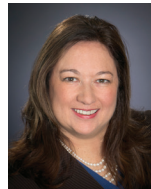
Catherine Sandoval Commissioner California Public Utilities Commission