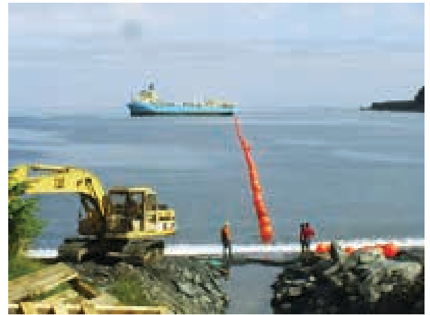
First National Bank Alaska

The business development team at U.S. Bank had this to say about the project: "This phase of the TERRA (Terrestrial for Every Region of Rural Alaska) project in northwestern Alaska was intended to meet the technology demands of schools and health clinics in these communities, so rural communities could better connect to a wide-range of resources and also address community concerns around social isolation and depression. In our conversations with key partners, it was clearly important to equip health care organizations with broadband access so they could effectively provide medical care, and take advantage of new technology such as access to electronic medical records and